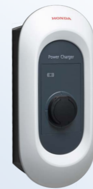
Honda Power Charger S+