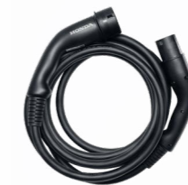
5 X Mode 3 Charging Cables