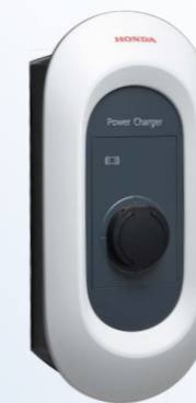
Honda Power Charger

No advanced smart home communication features are required.