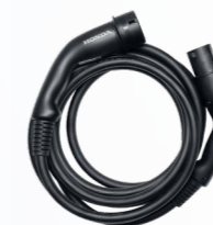
Mode 3 Charging Cable