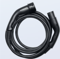
Mode 3 Charging Cable