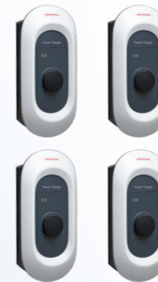
4 X Honda Power Charger S