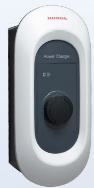
Honda Power Charger S+